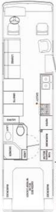
34' Gas-powered Cutter