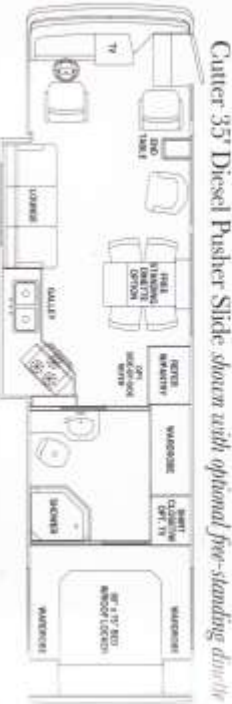
Cutter 35' Diesel Pusher Slide shown with optional free-standing dinette