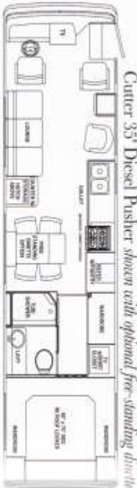
Cutter 35' Diesel Pusher shown with optional free-standing dinette