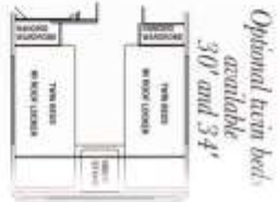
Optional twin beds available 30' and 34'