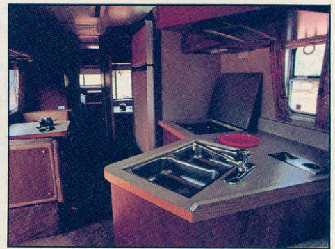
Clockwise from top: MCC extras include: six-position power seats, spacious bedroom, recessed range and sink and plenty of admiring glances. Below: The red rocks of Sedona.